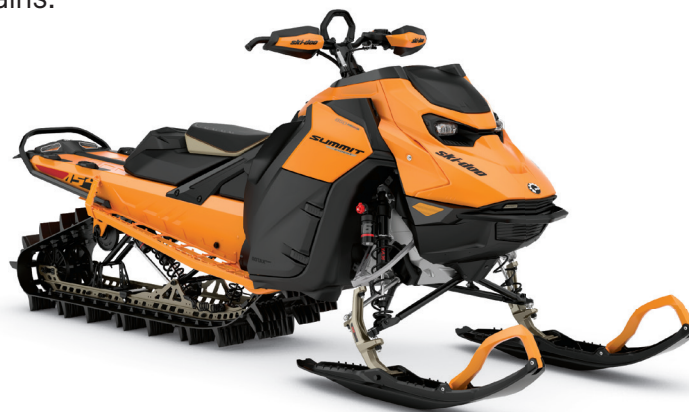
SUMMIT EXPERT 154 850 E-TEC TURBO R SHOWN

The ultimate precise and predictable deep-snow sled with features sharpened for most technical terrains.